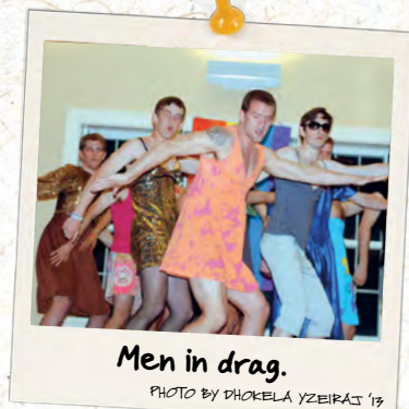
Men in drag.

Students document life at Colby with a new gallery of photos every week during the school year. From Jan Plan to Chinese New Year, laundry to midterms, it's easy to keep up through the Lens.