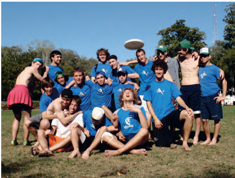
The Dazzlin' Asses, Colby's Ultimate Frisbee team, at the D-III national championships in Buffalo, N.Y., in May. It was the team's first appearance at the event, which followed a 17-2 season.

Ultimate Frisbee may conjure images of a relaxed, barefoot game for hippies, but ultimate (as it's commonly referred to among players) has evolved into an athletic and intensely competitive sport, today's players say.