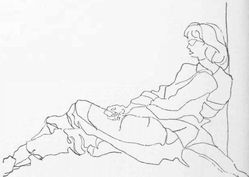
PENELOPE PIKE '68