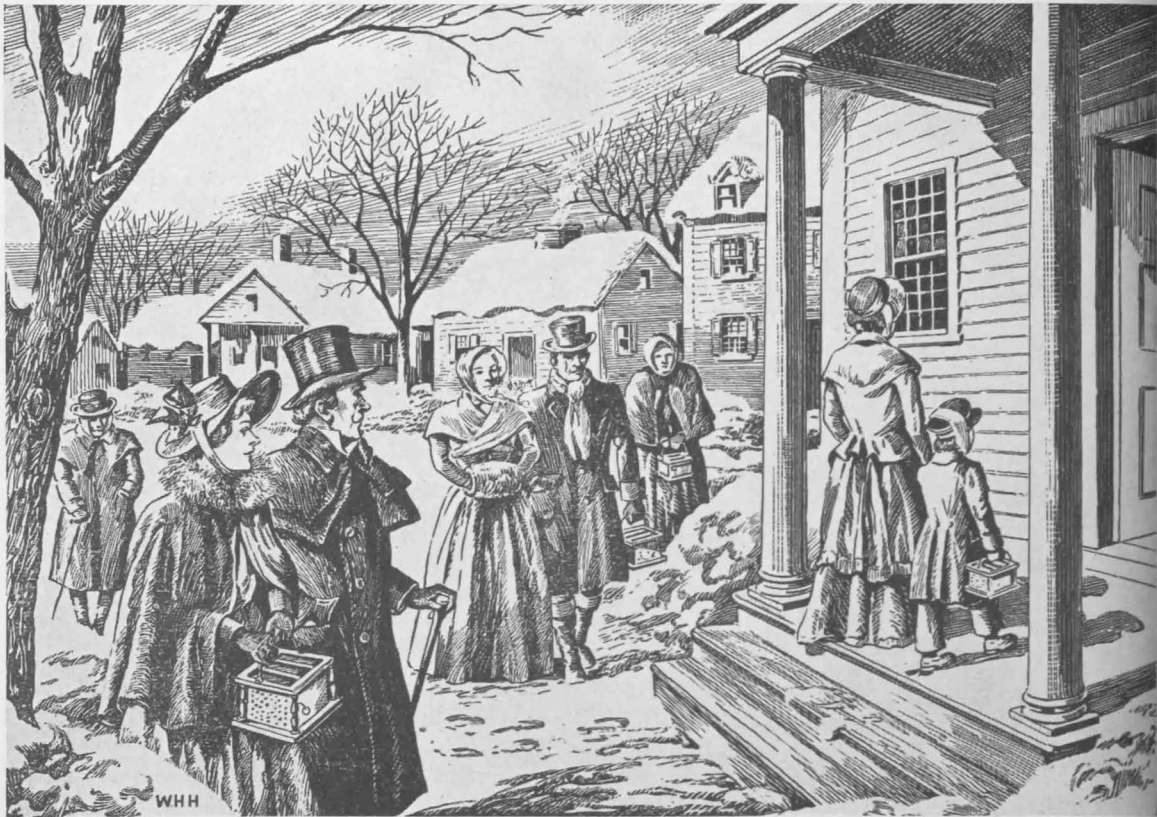
REPRODUCTION FROM A SERIES "PORTLAND IN THE 19TH CENTURY"

COPYRIGHT 1950, THE CANAL NATIONAL BANK OF PORTLAND, MAINE