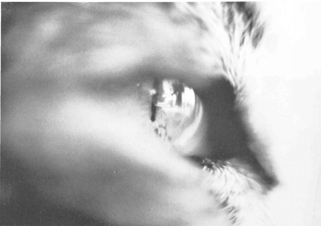
REFLECTION IN A CAT'S EYE; WINTER BOUGHS; BOAT ON MONHEGAN.