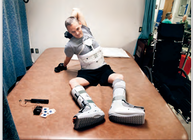
Above, boots protect his severely injured feet and ankles, shattered by the force of the bomb set off under his armored vehicle.