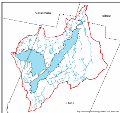
China Lake, Maine and Surrounding Watershed

GOALS: This research project was conducted in order to learn more about our local drinking water and to characterize our exposure to contaminants. We hope to increase public awareness of water quality issues by educating the local residents about their drinking water in order to promote public health and minimize exposure to some of the contaminants contained within public water supplies.